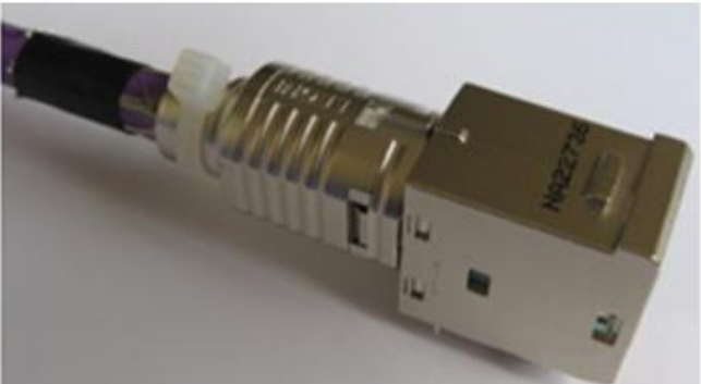
Fig. 3 Fig. 4