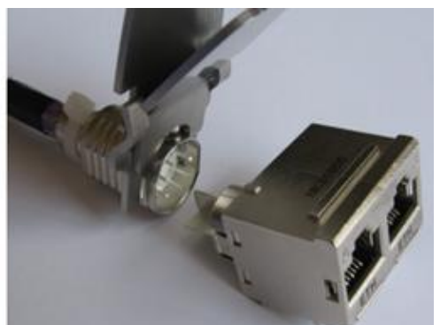
Fig.7 Fig.8 Fig.9