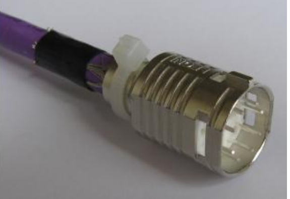
Fig. 1 Fig. 2