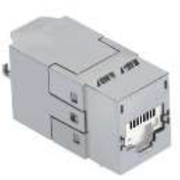
DataGate Jack C6A Part No KSJ-00062-02