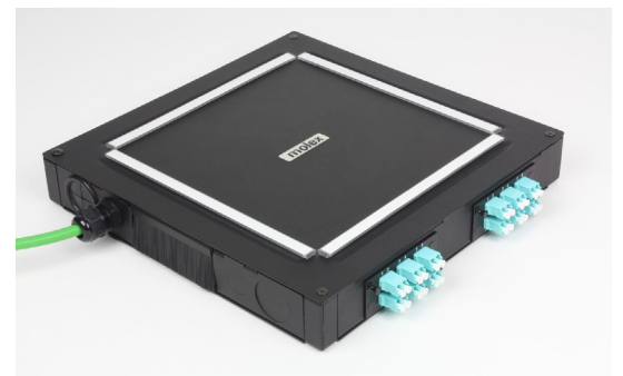
Shown assembled with fiber adapter plates