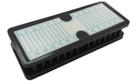
Fusion Splice Holder