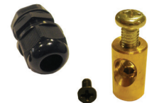
Gland & Retention Clamp

www.molexces.com/solutions-overview/zone-enclosures/