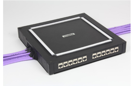
Shown assembled with DataGate Jacks

The cable management plate includes an opening designed for convenient copper cable bundle handling and is protected by a brush strip to reduce excess dust and debris. For maximum installation convenience, the brush strip can be removed and then replaced once the terminated cables are permanently positioned and secured in place. Also featured on the plate are circular knockouts to accommodate cable glands and grommets to protect fibre cables entering the chassis.