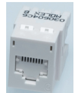
DataGate Jack C6