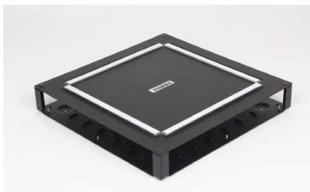
Unloaded Chassis and Cover