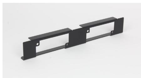
2 Aperture Carrier Plate