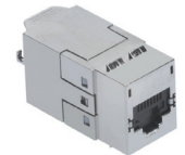
DataGate Jack C6A