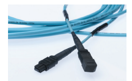
ModLink Cables (Contact Molex for part no. details)