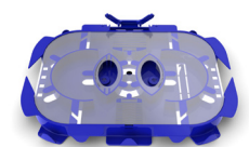
Universal Splice Tray

www.molex.com/solutions-overview/zone-enclosures/