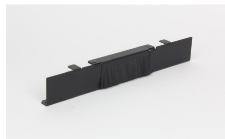
Cable Management Plate