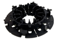
Self Adhesive Cable Management Hub