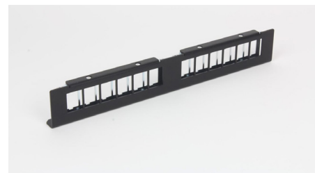
12 Port DataGate Jack Plate

www.molexces.com/solutions-overview/zone-enclosures/