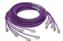
PowerCat C6A Pre-Terminated Cable Assemblies (Contact Molex for part no. details)