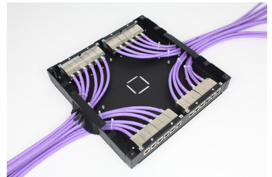
Internal view with copper assembly