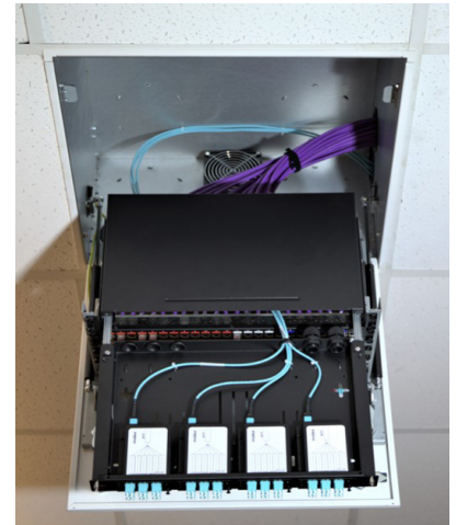
Fiber ModLink MTP/MPO installation