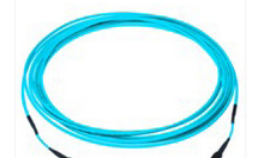
ModLink MTP/MPO cables