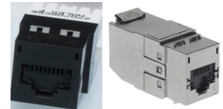
DataGate Jack UTP and C6A