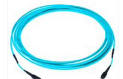
ModLink MTP/MPO cables