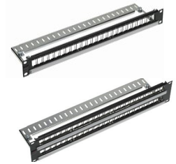
DataGate Patch Panels Unloaded