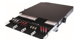
Specification Grade Fiber Enclosure