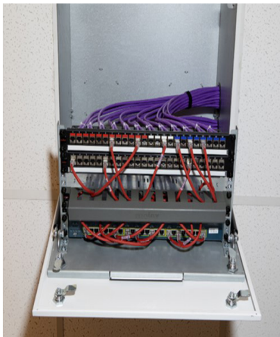
Active equipment installation