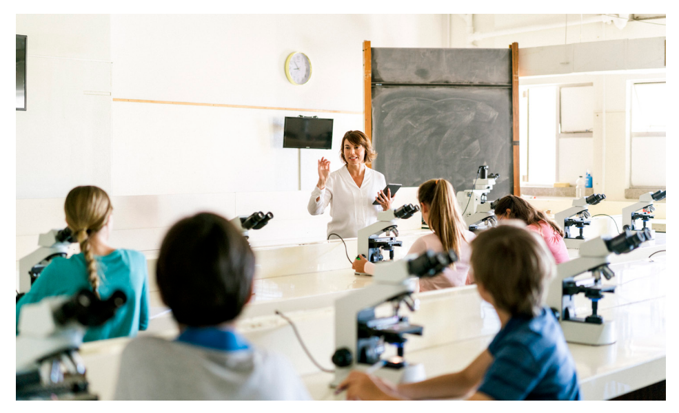
Conditions in a classroom can significantly impact student performance