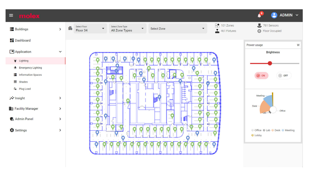
Visualizing data in a smart building dashboard

Sustainability is not just a matter of principle. Cost reduction through energy efficiency is often one of the biggest selling points for smart building installations. According to the American Council for an Energy-Efficient Economy, education buildings in particular could reduce their energy use by 11% by utilizing smart building technologies. As well as the long term benefits of reduced running costs, the financial savings may be leveraged to subsidize or underwrite the cost of the installation. One strategy is to implement smart lighting first, and use the cost savings from this to finance additional functionality.