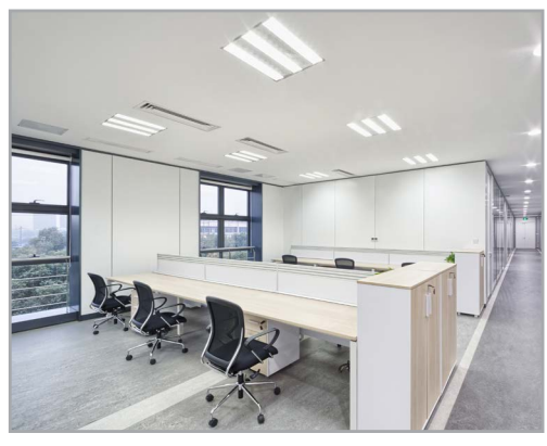
Smart building systems can integrate a wide range of data, devices and functions, from lighting control to occupancy monitoring

Don't believe the myths that smart buildings are costly or unsecure or that IoT technology is unproven. The reality is that a consolidated PoE platform is simpler and requires less material and labor than traditional architectures. A single integrated infrastructure is cost-effective and provides holistic enterprise security, whereas a disparate collection of smart systems is complex and expensive to manage and keep secure. PoE for building systems such as lighting, automated window shades, temperature, security