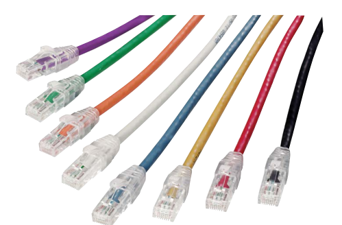
Safe and easy to implement, PoE runs on standard copper twisted-pair cables. Category 6A is recommended for most applications.

If you are working with consultants for lighting and other devices such as security, door controls and AV, explain that these devices will be powered and controlled on a PoE infrastructure. Limit your suggestions to efficacy and performance. The consultants should continue to do their job, determining things like fixture type, aesthetic considerations, and light levels. Once the reflected ceiling plan has been drafted, instead of handing it to the electrical engineers to place high voltage behind it, you will work with them to define the IoT platform