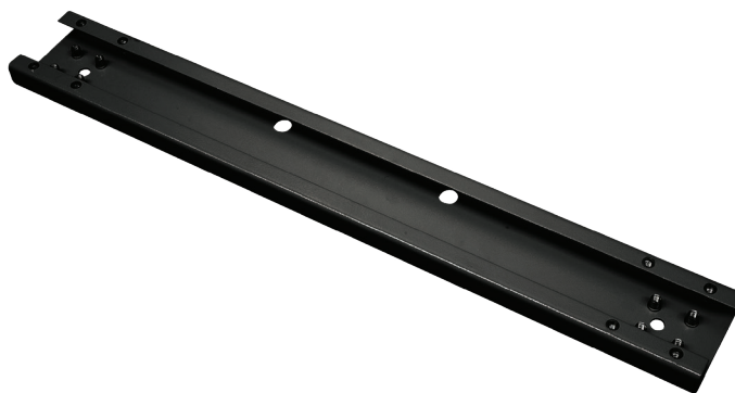
Strengthening Bar for Castors 300