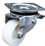
Locking Castor 300