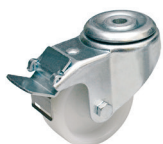
Locking Castor 150

For heavier loads Molex recommend using Locking Castor 300 type. One cabinet requires two locking and two nonlocking castors fitted to the two strengthening bars supplied in each kit. The kits are available with either 600mm (L) or 800mm (L) strengthening bars. Screws and washers for fixing are supplied in the kits.