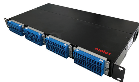
1RU 192F Xtreme Density Fibre Enclosure

Removable top cover providing easy access to the interior